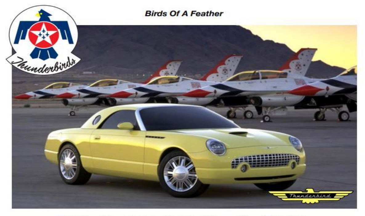
2003 Ford Thunderbird with U.S. Air Force Thunderbird Jets